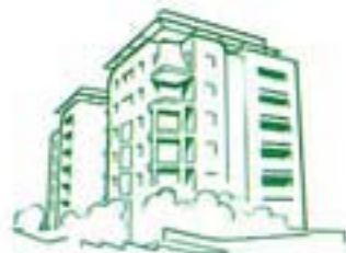
The Capital Gardens

To satisfy a real-estate growing demand for residential projects in Downtown Beirut, one of Lebanon's most important building contractors has decided to devote 37 million Dollars to two prominent residential projects in Beirut Central District, and 15 million dollars to a project in the Saifi zone.