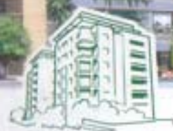
The Capital Gardens